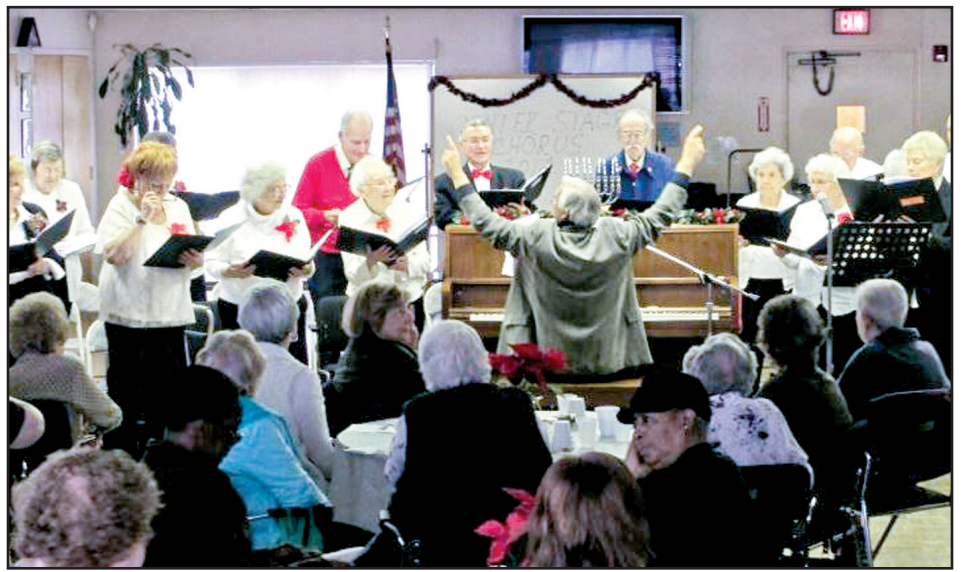
Join Sandel for a performance by Center Stage on December 10th