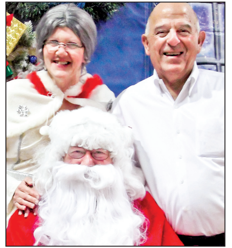
Join Santa and his helpers for the annual breakfast on Sunday, December 14th at the Recreation Center.

DETAILED INFORMATION FOR ALL ACTIVITIES CAN BE FOUND AT THE RECREATION CENTER OFFICE, ON THE RECREATION CENTER'S NEW WEBSITE AT WWW.RVCREC.WEBLY.COM , OR BY CALLING THE RECREATION CENTER AT 678-9238.