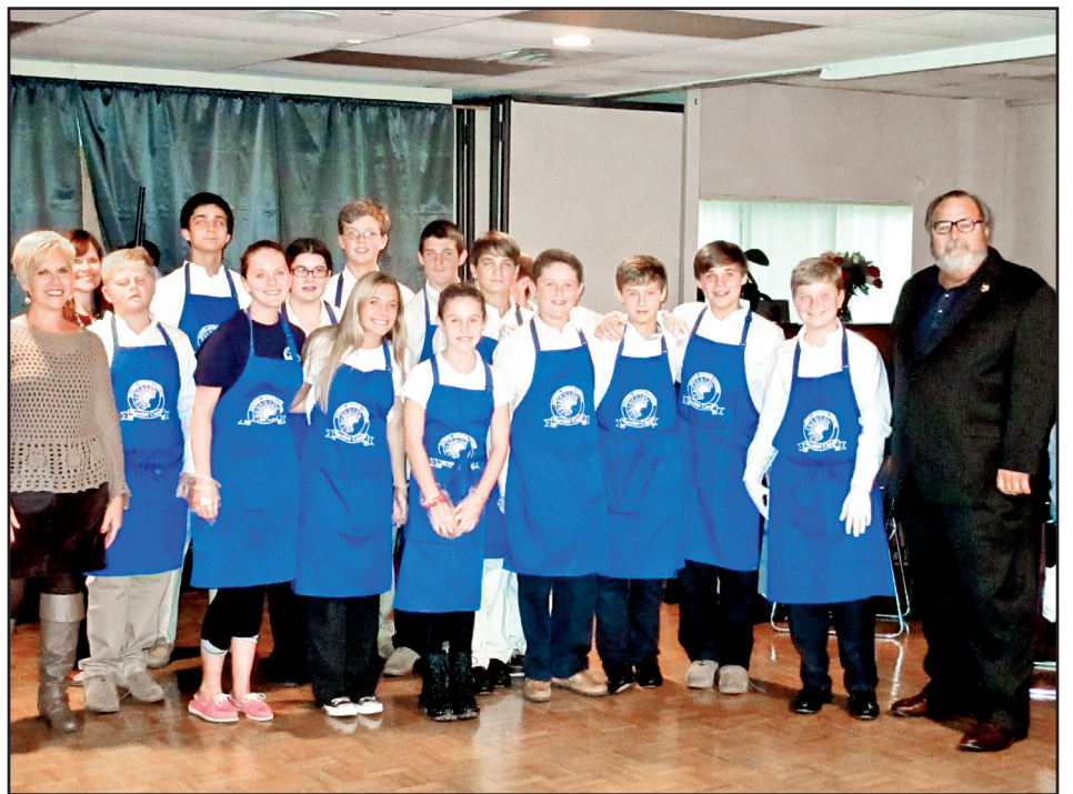
The "Sandel Supper Club" held its first Oktoberfest in early October. With the help of the Mayor's Youth Task Force, a German inspired meal was served for all to enjoy.

For information about the Rockville Centre Department of Senior Services, the Sandel Senior Center, or any of the programs and services offered, please call 678-9245.