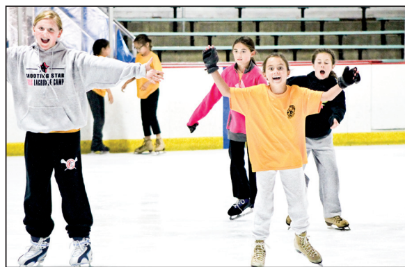
The Recreation Center has a variety of activities to get involved with including ice skating.