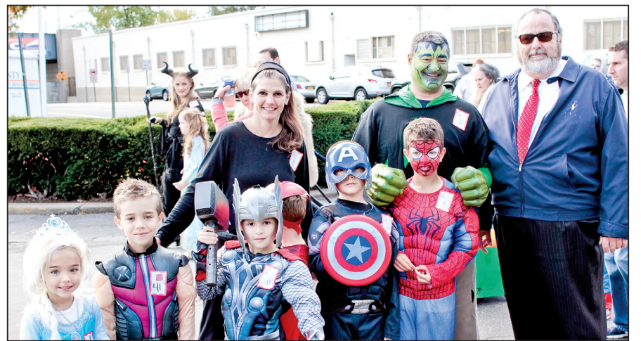
Hundreds of families came out to the annual Ragamuffin Parade.