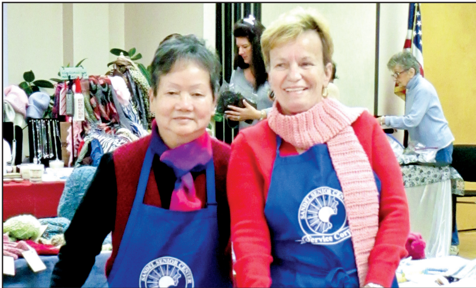
Sandel members got a jump on holiday shopping at the annual craft fair.